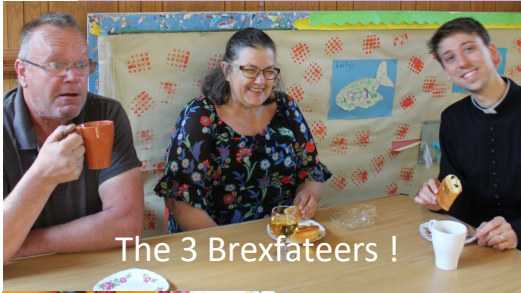
The 3 Brexfateers !