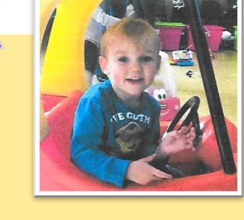
Each child's birthday is celebrated with a birthday cake.

The afternoon ends with the singing of action nursery rhymes.