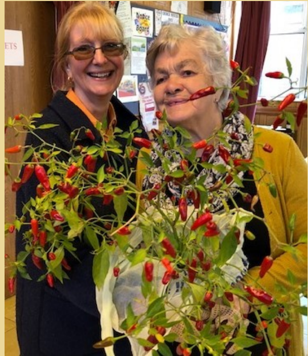
The Christ Church "hot chili peppers"