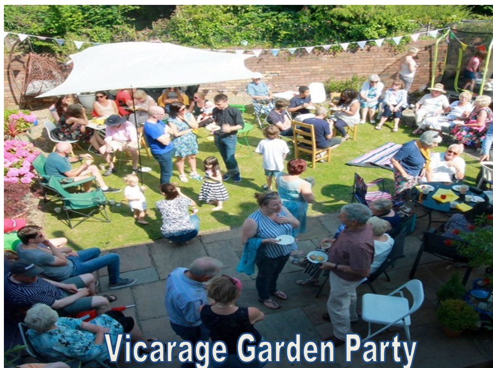
Vicarage Garden Party