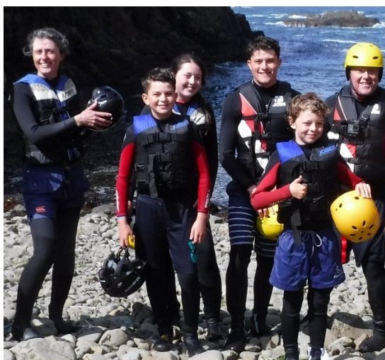
My family at the end of "coasteering" in Ireland this summer