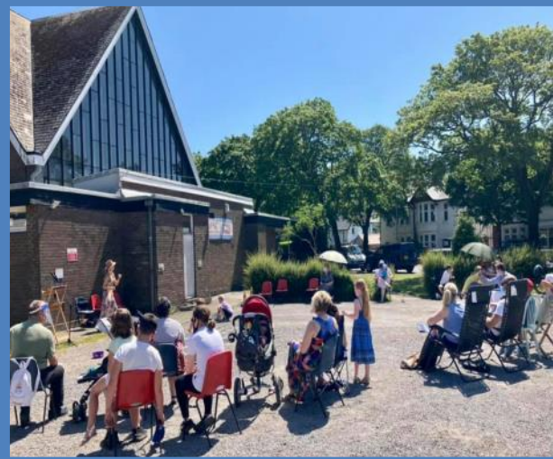
OUTDOOR FAMILY SERVICE IN JUNE